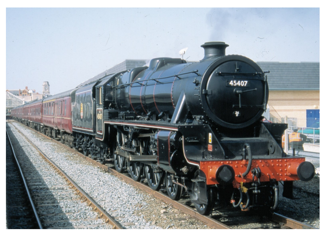
Black Five 45407 at Aberystwyth.