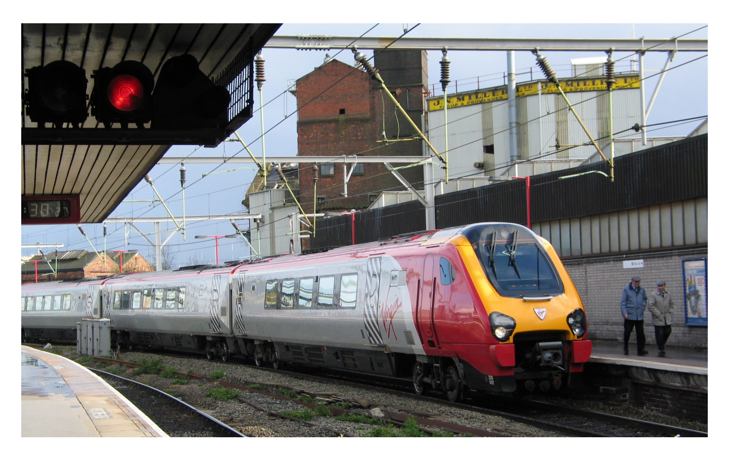
The new order—a Voyager at Wolverhampton 5th April 2004.