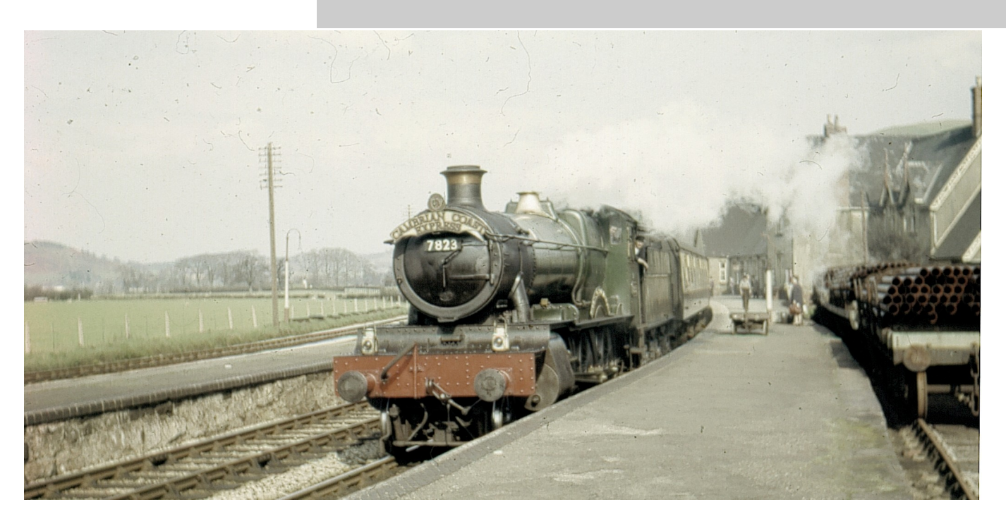
The old order—the down Cambrian Coast Express at Moat Lane, 24th April 1962. The same train at Machynlleth is shown on p.17.